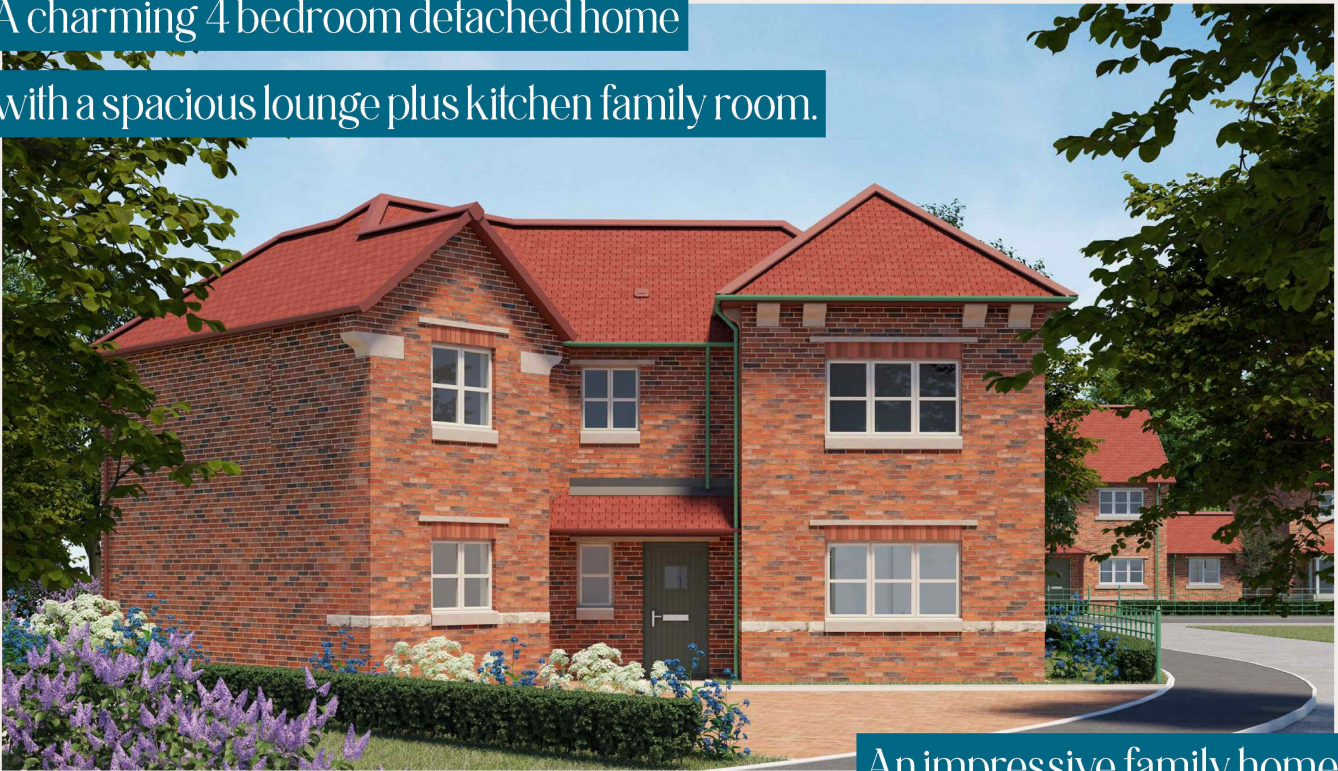
An impressive family home.

A charming 4 bedroom detached home with a spacious lounge plus kitchen family room.