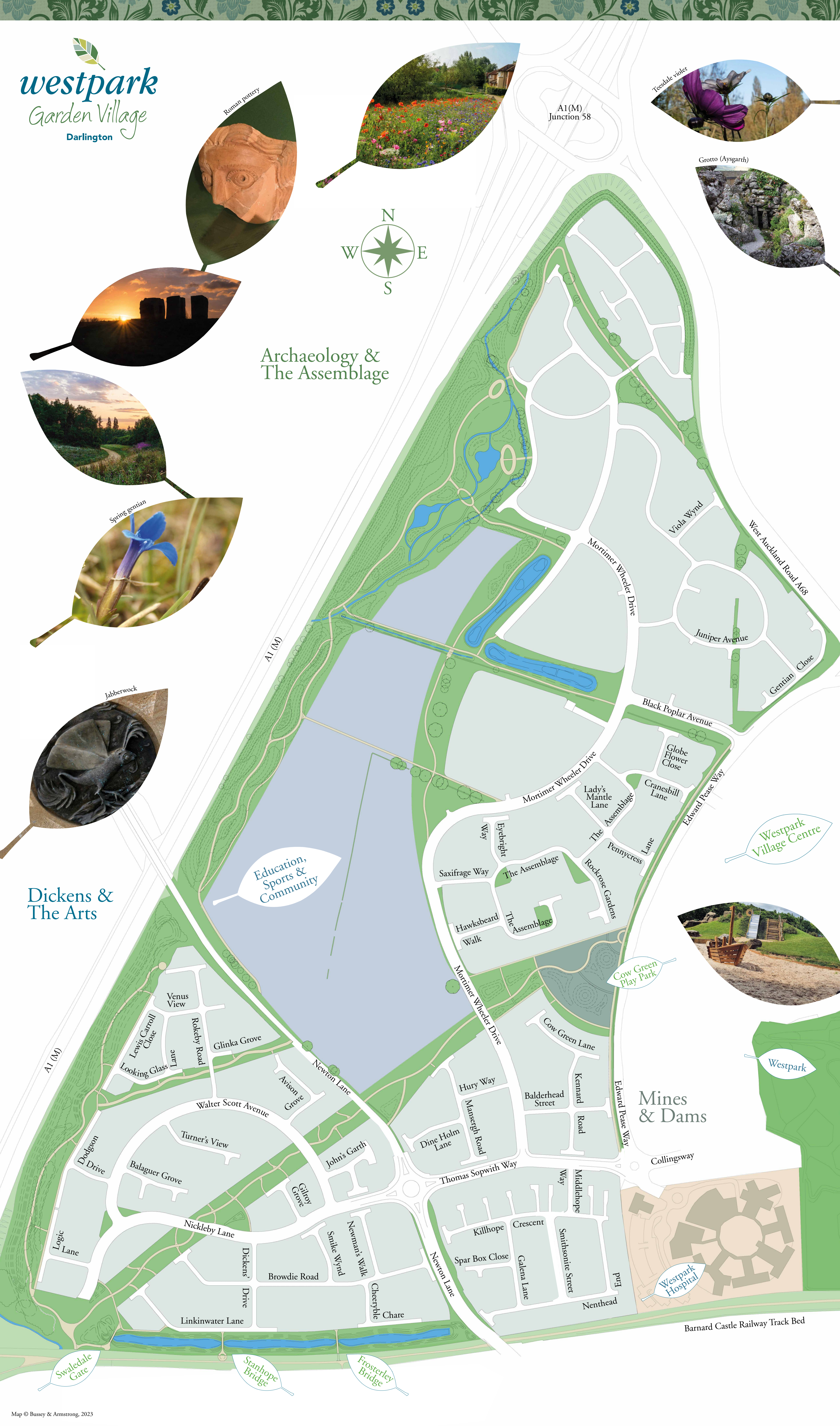
Barnard Castle Railway Track Bed