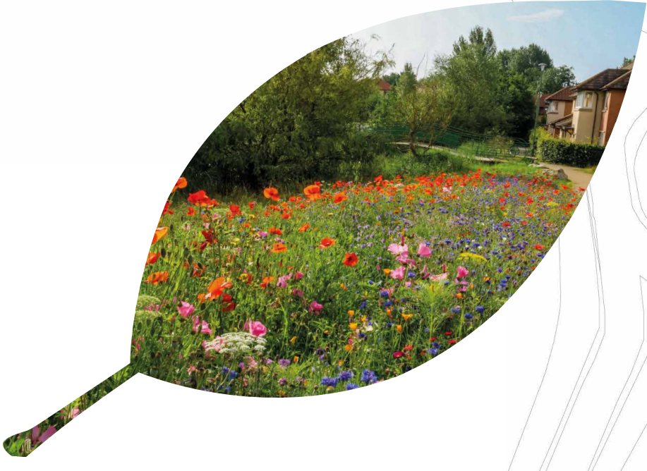
A1(M) Junction 58